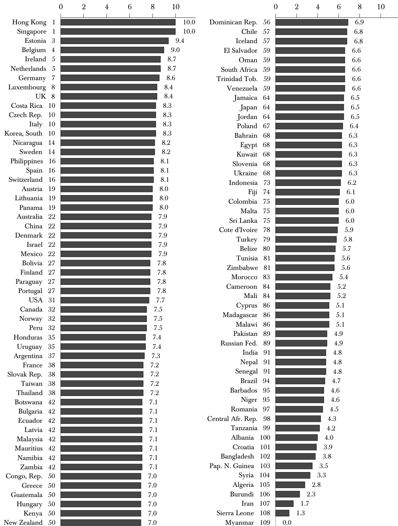
Exhibit 3-1: Trade Openness Index (1998)